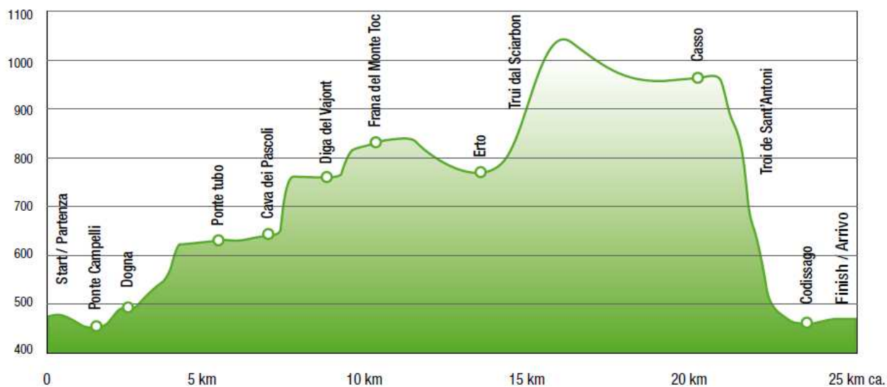
STRADA PER ERTÒ